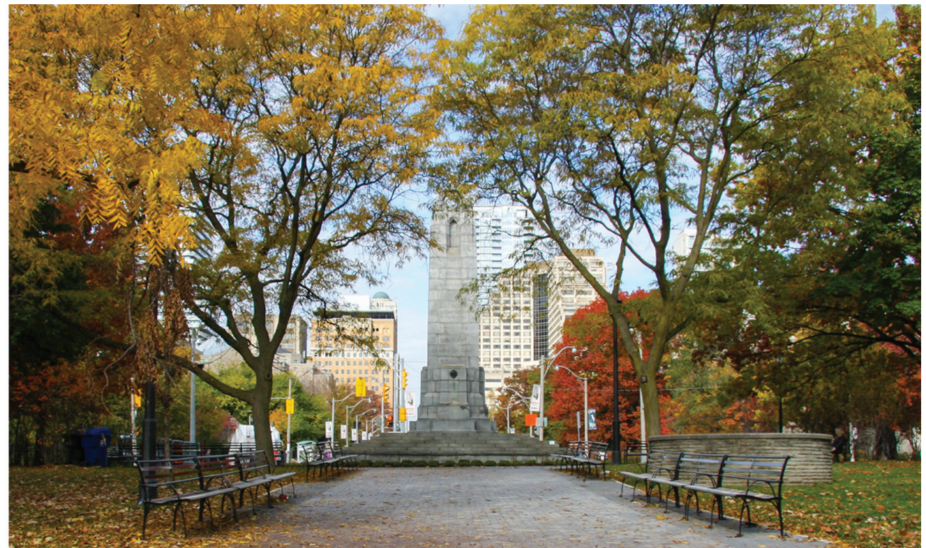
City of Toronto