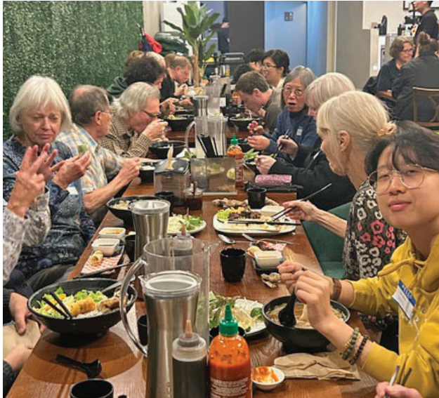
Another great monthly dinner

We are very lucky to have dozens of excellent restaurants within walking distance. And since Fall 2024, our monthly diners have enjoyed delicious food at several of these restaurants. Pho Ha Noi (Vietnamese, on College), Bar Eugenie (global flavours, on Harbord), Ramen Isshin (Japanese on College), Arisu Korean BBQ & Sushi (on Bloor), Peaceful Restaurant (Chinese, on Bloor), and The Chulo (Nepalese) and Indian Desire (both on Bloor), to name a few.