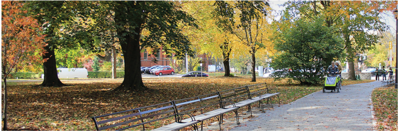
City of Toronto

for protection and ongoing care over 50 years, could any elements of the plan be considered.