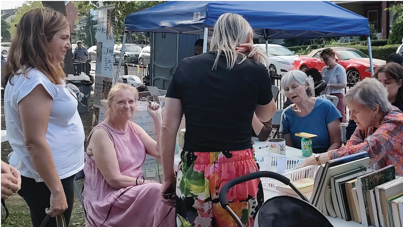
Two green thumbs up for the HV Gardeners Group