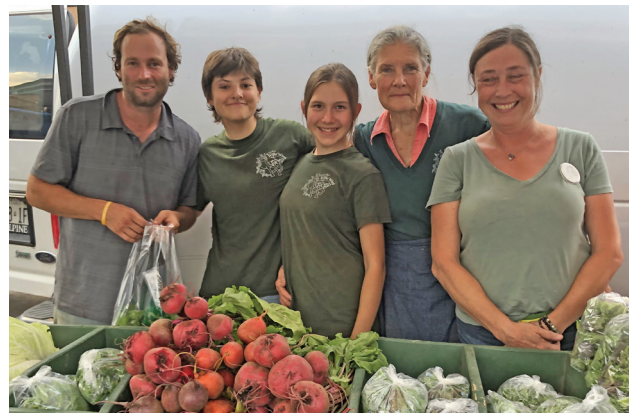
Three generations of Willo' Wind Farms' Stocking family

Be sure to sign up for our newsletter at bloorborden.com —you'll get vendor and produce updates, plus lots of great recipes and helpful hints!