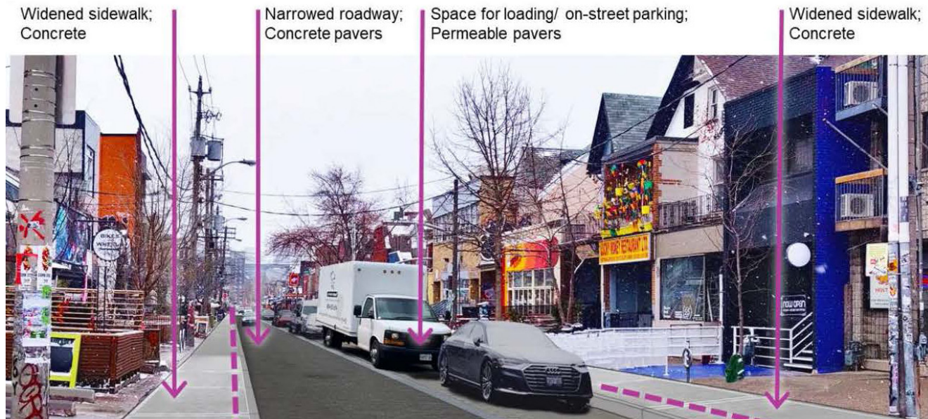
City rendering of preliminary proposal for Augusta Ave. Designs proposed for Kensington Market at toronto.ca/KensingtonSafeStreets .

takes 2 m of the road, leaving 2 m for parking and 3.4 m for traffic. Let your eye extend that in-street planter for the length of the street to image a boulevard there.