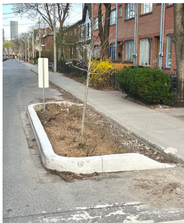
Ulster in-street planter

At its March 2023 meeting, the HVRA board formally asked the City to model a 1.4 m boulevard proposal, identify target blocks for the project, and consult residents. We're excited to see the possibilities.