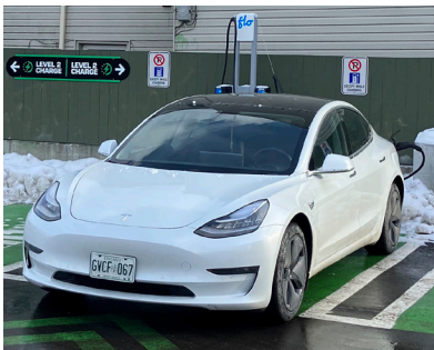
Electric car-charging at Green P parking lot