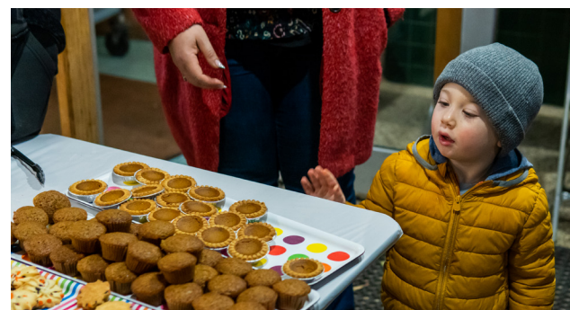
Contemplating treats at Harbord Bakery

While 2023 details are still in development, we can enjoy the memories of 2022, which saw a full and safe return of our wonderful annual event—in person! Harbord St. was once again lined with carved pumpkins from across HV, accompanied by hot cider and treats provided by local businesses. Neighbours and visitors alike enjoyed the lit-up artistry of the season in some of the best weather we've ever had! Thanks to the massive team of volunteers—students, residents, and business owners—who helped make it such a success. Check out the fantastic photos at https://bit.ly/3LIPa5p .