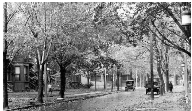
Markham St. 1924