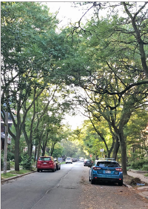
Markham St. now