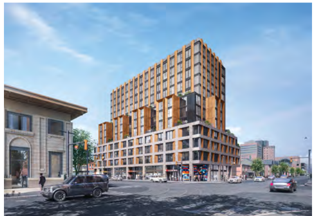
419–431 College St., looking southeast