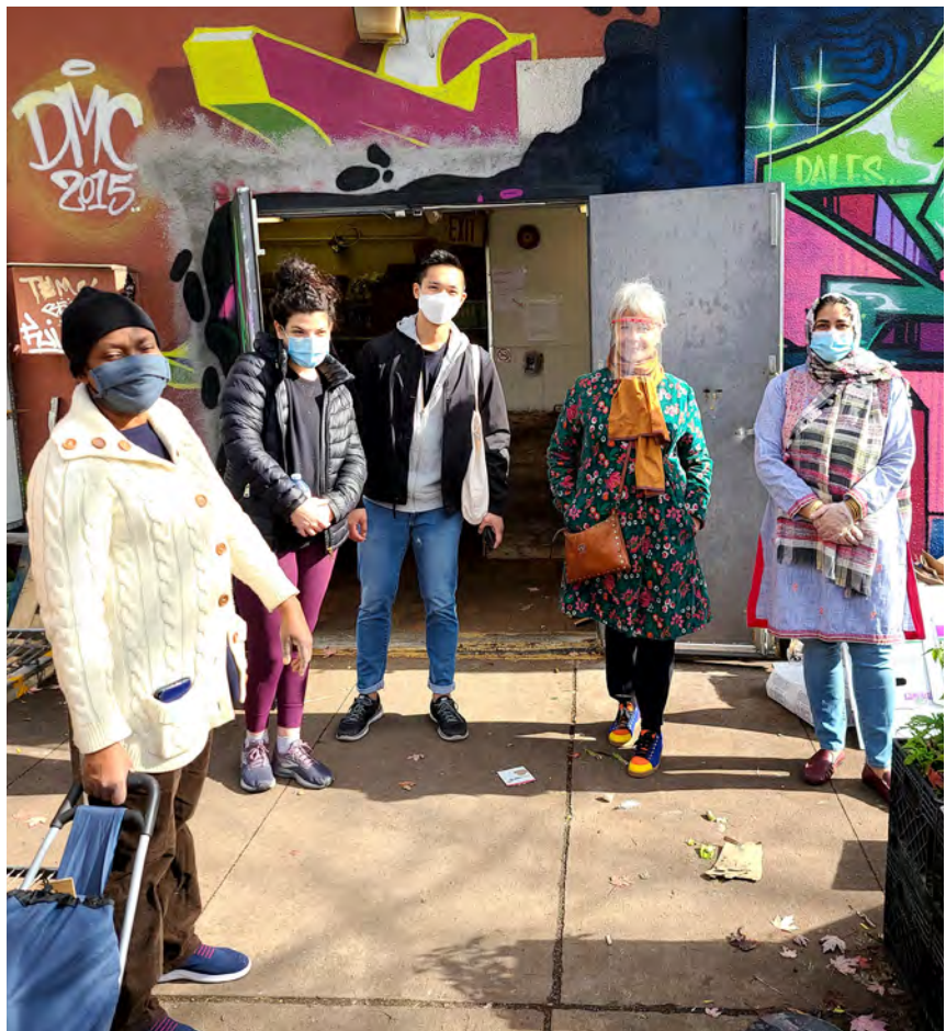
Thanks, Fort York Food Bank volunteers

In December and January, we worked with Kensington Gardens to highlight and promote their fundraiser to the Harbord Village community for a towel warming cabinet, which helps their residents stay comfortable and warm after bathing. Additionally, we connected with the Fork York Food Bank and Scott Mission to promote their fundraising campaigns. As we move into spring with the light at the end of the tunnel it is important that we continue to support those in challenging situations.