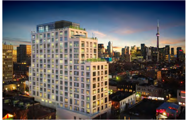
The Waverley, at Spadina and College

*More details at City’s website at http://app.toronto.ca/AIC/index.do .