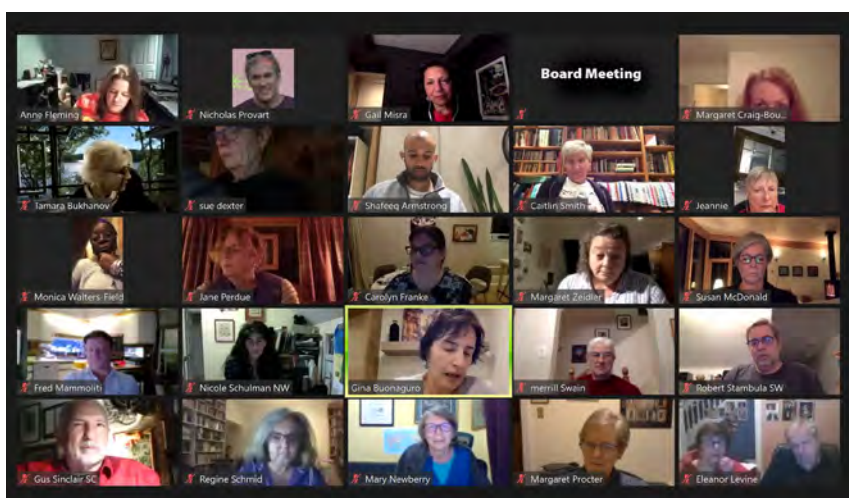
Our first Zoom AGM, in October 2020