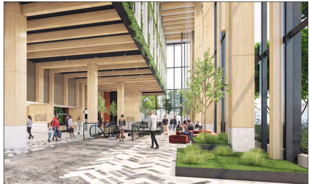
350 Bloor St. interior