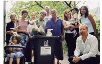
The Composting Team

If you are interested in having composting bin for your street, please contact your area representative or myself at (416) 960-1244.