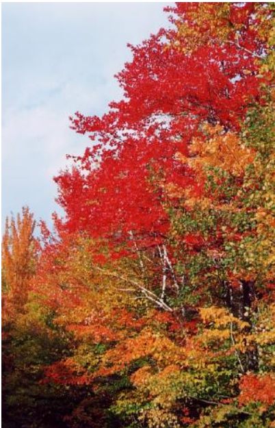
Your neighbourhood at it's best!