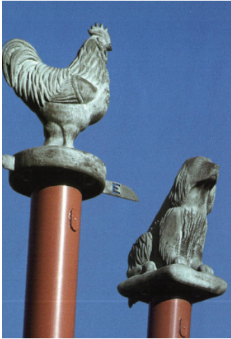
At Sussex & Spadina: bronze castings of Rooster and Spaniel.