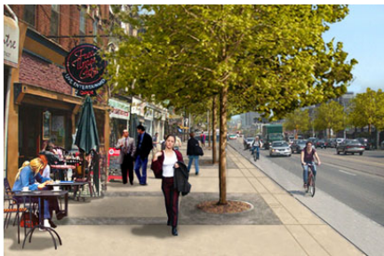
... and after.

“...since sidewalk replacement only occurs every 40 years...let’s go for it!”