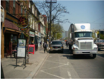
Free Times view – before...