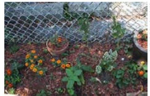
Accents of sweet colour dot the west side of the lane.